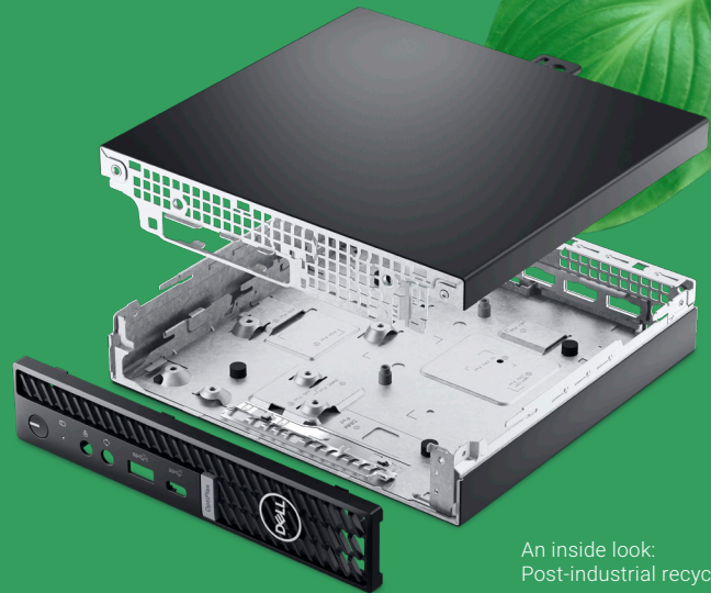
An inside look: Post-industrial recycled steel

OptiPlex is passionate about reducing our products' carbon footprint and helping our customers make an impact on the future. And its why Micro is now the most energy efficient ultracompact commercial PC 1 . We take a circular design approach – innovating with renewable materials, packaging, energy conservation, recycling and even repairability.