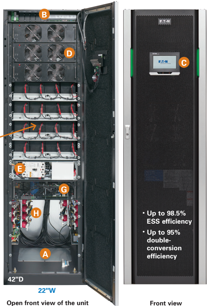
Open front view of the unit