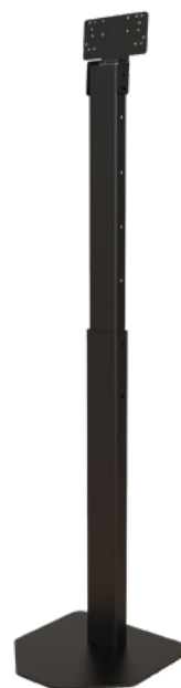
CAMERA-STAND-VB front view with video bar attachment without camera, extended