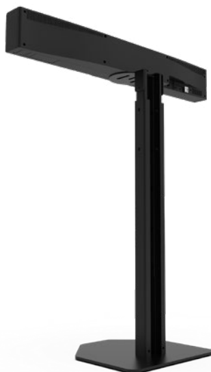
CAMERA-STAND-PTZ back view with Yealink A30 MeetingBar camera, not extended