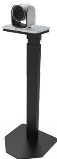
CAMERA-STAND-PTZ front view with Poly Eagle Eye IV camera, not extended