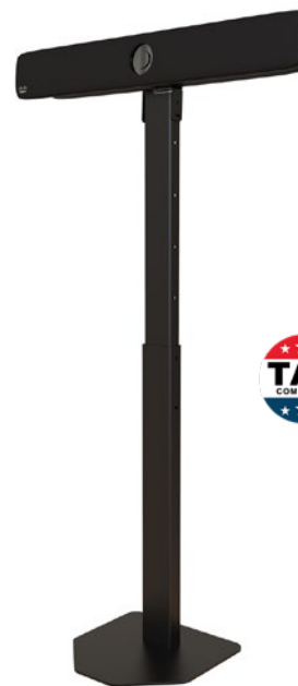
CAMERA-STAND-CRK extended with Cisco Room Bar camera