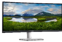
Dell 34 Curved Monitor – S3422SW

Enjoy more immersive cinematic experiences on a 34" lifestyle-inspired curved monitor with an ultrawide WQHD screen, built-in dual 5W speakers and a height adjustable stand.