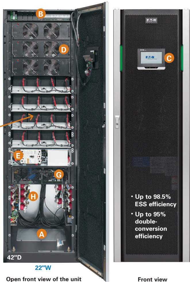
Open front view of the unit