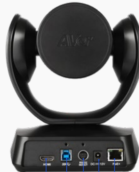
HDMI out USB 3.1 type-B RS232 in/out DC 12V LAN for IP streaming and PoE+