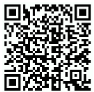
K120 3D demo