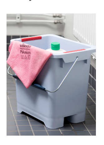
Hand grip for easy carrying.

Second bucket can be used to carry cloths, chemicals etc.