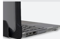
COMPLETE PORT ACCESS