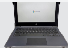
RUGGED CORNER PROTECTION