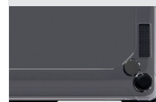
HEAT DISPERSION AIR VENTS