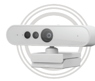
Lenovo 510 FHD Webcam