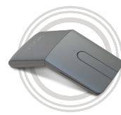
Lenovo Yoga Mouse with Laser Presenter