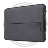
Lenovo Urban Sleeve Case