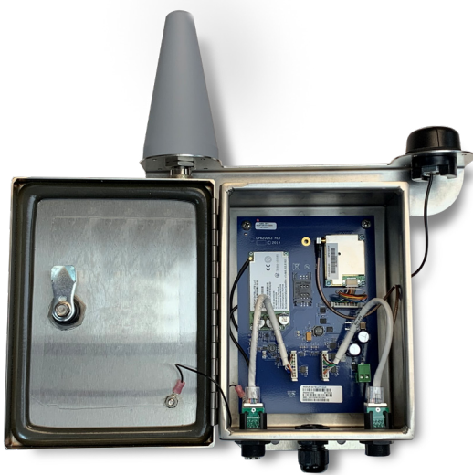
Above Deck Unit (ADU)