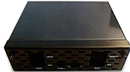
Below Deck Unit (BDU)