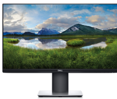
DELL 24 MONITOR | P2421D

Optimize your workspace with this efficient 23.8" monitor built with an ultrathin bezel, a small footprint and comfort-enhancing features.