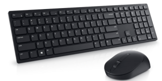
DELL PRO WIRELESS KEYBOARD AND MOUSE | KM5221W

Optimize conference calls and multimedia streaming with exceptional audio clarity. Minimize background noise while on calls with the dual mic array and echo cancellation feature.