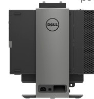
OPTIPLEX SMALL FORM FACTOR ALL-IN-ONE STAND

Minimize your footprint with this arm that offers easy installation and enhanced adjustability while keeping cables neatly hidden from view.