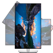
DELL ULTRASHARP 24 MONITOR | U2422H

Optimize your workspace with this efficient 23.8" monitor built with an ultrathin bezel, a small footprint and comfort-enhancing features.