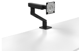
DELL SINGLE MONITOR ARM | MSA20

Mount your system on a wall or under a desk. Includes an adapter box to securely house the system's power adapter.