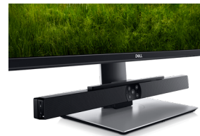
DELL PROFESSIONAL SOUND BAR | AE515M

Take your work to new heights with this 23.8-inch FHD monitor with a wide color coverage. Features ComfortView Plus an always-on built-in low blue light screen, fast connectivity and transfer speeds.