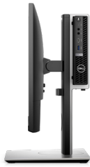
OPTIPLEX MICRO ALL-IN-ONE STAND

Small footprint mounting solution adapts to your environment, with cable management and monitor height adjustability, tilt, swivel and pivot functions.