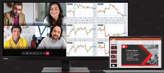
Master the art of multi-tasking

The P34w-20 kicks your work up a notch with outstanding visuals to show accurate colors from any angle. With WQHD 3440 x 1440 resolution, the monitor helps you capture even the smallest details while seeing true-to-life color with a 99% sRGB color calibration Delta E<2. Designed to impress, the 2 x 3W built-in speakers offer immersive audio that is true to your ears. The P34w-20 is also created with your health and comfort in mind, with eye-care and Natural Low Blue Light technology to reduce harmful high energy blue light emissions. Adjust the monitor height up to 150 mm to suit your ideal working style or position. Meanwhile, Lenovo ThinkColour 2 software allows you to easily and quickly adjust your screen settings with a simple click to enhance your work efficiency and optimize your monitor's extensive capabilities. Lenovo patented features, such as LAN on ThinkColour, show the network status from the screen to facilitate a more seamless workflow.