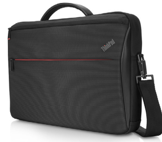
ThinkPad 14-inch Professional Slim Topload