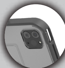
Full Port Access