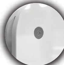
Theft-Detering Screw System