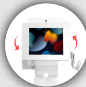
Portrait & Landscape