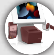
Holds Multiple Devices