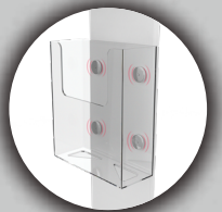
Magnetic Brochure Holder