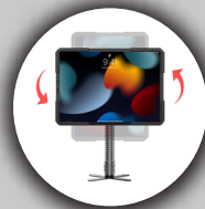
Portrait & Landscape