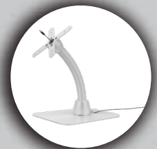
Efficient Cable Management