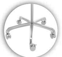
Locking Swivel Casters