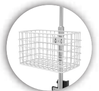
Metal Basket Storage