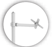
Versatile VESA Compliant