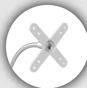
VESA compatible 75mm x 75mm & 100mm x 100mm