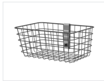
SMALL WIRE BASKET DARK GREY 98-6136-282