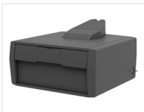
TALL SINGLE DRAWER DARK GREY 97-989-622

Additional accessories available in white