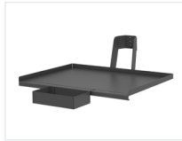
FRONT SHELF DARK GREY 98-417-289