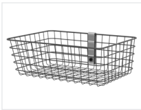
LARGE WIRE BASKET DARK GREY 98-135-282