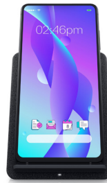
Dell Dual Dock - HD22Q

Experience industry leading video quality and picture clarity in any lighting with this intelligent 2K QHD webcam.