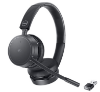
Dell Pro Wireless Headset - WL5022

Powerfully productive, this compact dock is the world's first laptop docking station with a wireless charging stand for Qi-enabled smartphone or earbuds.