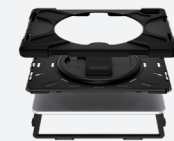
TRIPLE LAYER PROTECTION