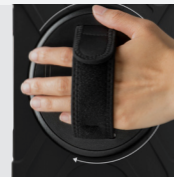
360° ROTATING HAND STRAP & KICKSTAND