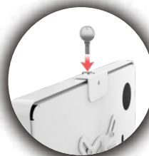
Lock & Key Security System