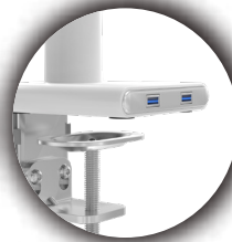
USB Ports at the Base