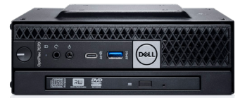
OPTIPLEX MICRO DVD+/-RW ENCLOSURE

Mount your system between two VESA compatible devices. Includes an adapter box to securely house the system's power adapter.