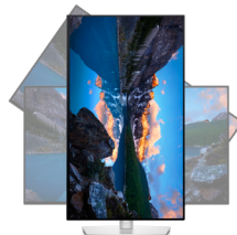
DELL ULTRASHARP 24 MONITOR - U2422H

Optimize your workspace with this efficient 23.8" monitor built with an ultrathin bezel, a small footprint and comfort-enhancing features.