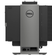
OPTIPLEX SMALL FORM FACTOR ALL-IN-ONE STAND

Minimize your footprint with this arm that offers easy installation and enhanced adjustability while keeping cables neatly hidden from view.