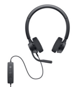
DELL PRO WIRED HEADSET - WH3022 (COMING SOON)

Custom dust filters safeguard internal components in factory, warehouse, or retail environments.