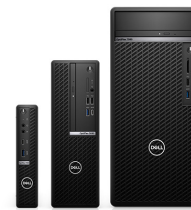
OPTIPLEX DUST FILTERS

Thermally tested custom cable covers offer an easy to install and attractive way to manage cables and secure ports.