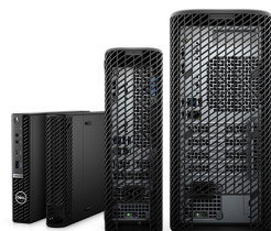
OPTIPLEX CABLE COVERS

Wired mouse with fingerprint reader offers convenient and secure login and online access without passwords.