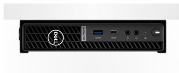
OPTIPLEX MICRO VESA MOUNT WITH ADAPTER BRACKET

Mount your system on a wall or under a surface with a VESA-compatible DVD+/-RW enclosure with full optical drive access. Includes an adapter box to securely house the system's power adapter.