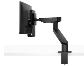
OPTIPLEX MICRO DUAL VESA MOUNT WITH ADAPTER BRACKET

This mount allows the Micro to be VESA mounted to select Dell E Series displays.