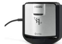
X-RITE COLORIMETER | DISPLAY PRO The iDisplay Pro ensures a perfectly calibrated and profiled display while delivering the speed, options and flexibility needed to maintain color accuracy.

*Based on Dell internal testing using included cable and connected to Dell PCs supporting USB 3.1 Gen 2.