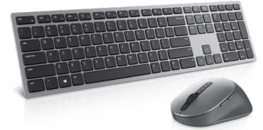
DELL PREMIUM WIRELESS KEYBOARD AND MOUSE | KM7321W

Dell's most powerful dock delivers the ultimate productivity experience for 7000 Series mobile workstations. Charge your system faster, display up to three 4K monitors, and connect your peripherals via a single cable with dual USB-C connectors.