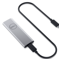
DELL PORTABLE SSD, USB-C 250GB

Protect your notebook and accessories with this lightweight backpack that is made with shock-absorbing EVA foam and Dell's EcoLoop™ solution dyeing process.