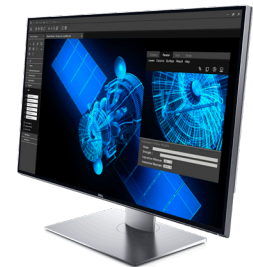
DELL ULTRASHARP 32 8K MONITOR | UP3218K

*CalMAN license required, sold separately