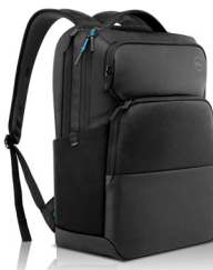
DELL PRO BACKPACK 17 | PO1720P

Experience realistic images like never before on the award-winning, world's first 31.5" 8K monitor featuring Dell PremierColor.