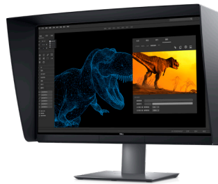
DELL ULTRASHARP 27 4K PREMIERCOLOR MONITOR WITH A HOOD | UP2720Q

3Dconnexion's patented 6-Degrees-of-Freedom (6DoF) sensor is specifically designed to manipulate digital content or camera positions in the industry-leading CAD applications. Simply push, pull, twist or tilt the 3Dconnexion controller cap to intuitively pan, zoom and rotate your 3D drawing.