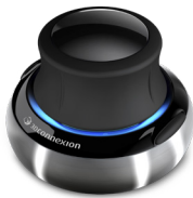
3DCONNEXION SPACEMOUSE WIRELESS

Multi-task seamlessly across 3 devices with this premium full size keyboard and sculpted mouse combo with programmable shortcuts and 36 months battery life.