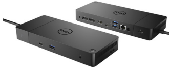
PRECISION THUNDERBOLT DOCK | WD19TB

SMART SOLUTIONS TO HELP YOU WORK MORE EFFECTIVELY.