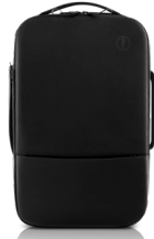
DELL PRO HYBRID BRIEFCASE BACKPACK 15 | PO1520HB

Protect your laptop from impact with this earth friendly backpack that is lined with EVA foam cushioning. Easily convert from backpack to briefcase mode and travel with ease.