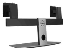
DELL DUAL MONITOR STAND | MDS19

Multipoint with integrated speakerphone offers an all-in-one connectivity and conferencing solution.