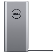
DELL NOTEBOOK POWER BANK PLUS - USB C, 65 WH | PW7018LC

Connect your mouse conveniently via 2.4GHz wireless or Bluetooth and enhance your productivity with programmable shortcut buttons and 36 months 25 of battery life.