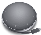
DELL MOBILE SPEAKERPHONE | MH3021P

Designed to work seamlessly across 3 devices, this compact keyboard mouse combo keeps your desk clutter-free and lets you stay productive with up to 36 months 26 of battery life.