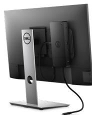
DELL DOCKING STATION MOUNTING KIT | MK15

Work at full speed with Dell's powerful Thunderbolt Dock. Charge your system faster, support up to two 4K displays and connect to your peripherals via a single cable.