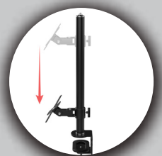
Height Flexible Versatility