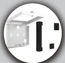
Interior Foam & Sheet for Tablet Compatibility