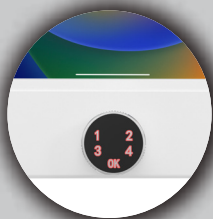
Digital Lock Anti-Theft Security