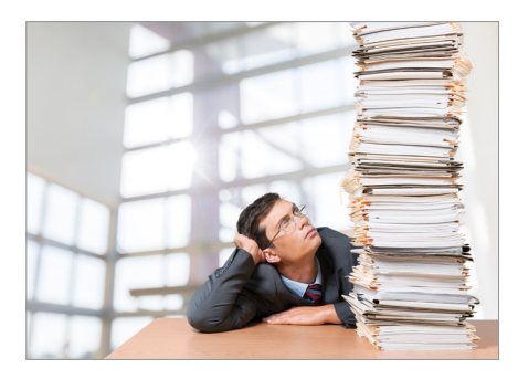
For continuous operation

The powerful motor ensures a high cutting capacity and reliable continuous operation (from HSM SECURIO AF150).