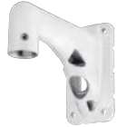
WV-QWL501-W Mount Bracket