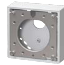
WV-QJB500-W Mount Bracket