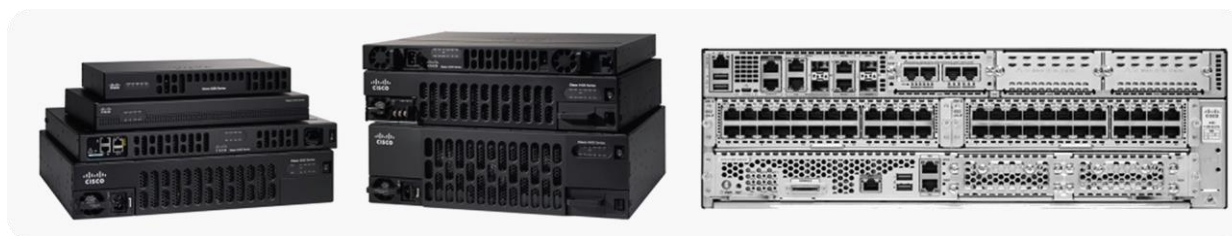
Figure 1. Cisco 4000 Series Integrated Services Routers

The Cisco 4000 Family contains the following platforms: the 4461, 4451, 4431, 4351, 4331, 4321 and 4221 ISRs.