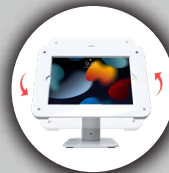
Portrait & Landscape