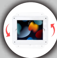
Portrait & Landscape