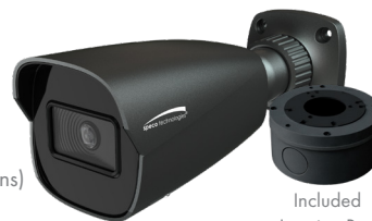
Included Junction Box