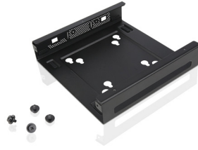
ThinkCentre Tiny VESA Mount II