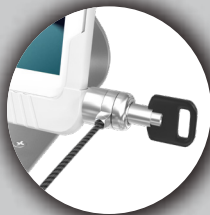
Lock & Key Security System