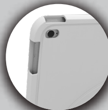
Access to All Ports and Buttons