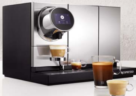
NESPRESSO MOMENTO COFFEE & MILK 120

Simply intuitive, for your Barista-style coffee experiences