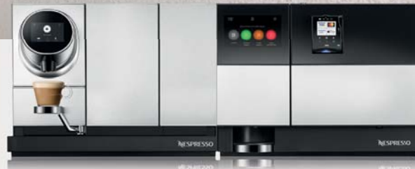
SIDE BY SIDE