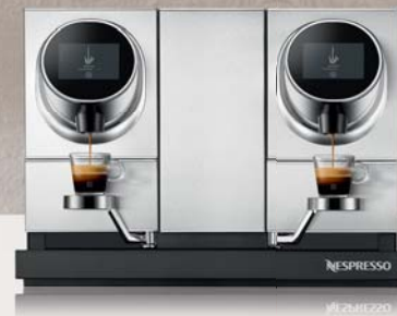
NESPRESSO MOMENTO COFFEE 200

Simply bigger, for real connected moments