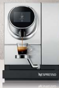
NESPRESSO MOMENTO COFFEE 100

Simply intuitive, for your daily coffee experiences