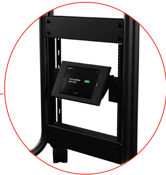
RPS-500S with CN-RM