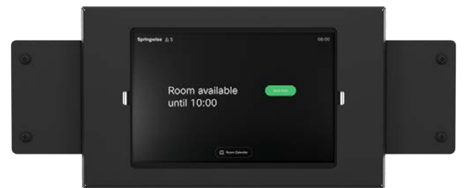
Shown with Cisco Room Navigator