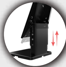
Height Adjustable Flexibility