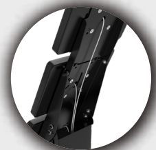
Efficient Cable Management