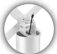
Efficient Cable Management Through Core