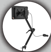
Mobile Inductive Charging Kit

For delivery drivers – or anyone who needs a wireless tablet case and stand combination for cars, commercial fleets, and trucks, look no further than CTA Digital's Vehicle Mount with Inductive Charging Case Kit. The durable, splash-proof and drop-tested case features a powerful inductive charging back plate that prevents the need to remove the iPad to plug in a charging cable. The case sits securely on a multi-jointed tablet mount that's easy to install onto – and remove from – any seat rail, all without the need to drill into your vehicle. This flexible, multi-jointed tablet mount keeps your tablet fully accessible. The aluminum arm features tension-locking ball socket joints at the base and head, plus an additional rotating knee joint, giving you virtually infinite positioning options. To use, simply plug the power cable into your car's power socket. Plug the case into your iPad's charging port. When the inductive pads align, an electromagnetic field charges the battery. When ready to take your iPad with you, simply pop the case off the stand, slip your hand into the padded strap at the rear of the case, and you're set. Rear magnets allow for easy return to a mounting stand. This kit is compatible with iPad 7th and 8th Generation 10.2-inch, iPad Pro 10.5-inch, iPad Air 3 & 4, and more.