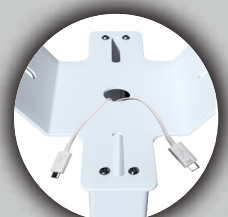
Built-in Cable Management