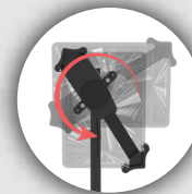
Portrait / Landscape Orientation