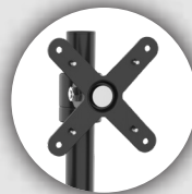
VESA 75x75 or 100x100 Compatibility