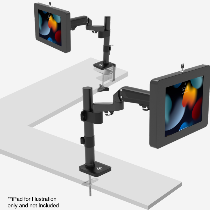
**iPad for Illustration only and not Included