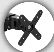
VESA 75x75 or 100x100 Compatibility