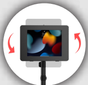
Portrait / Landscape Orientation