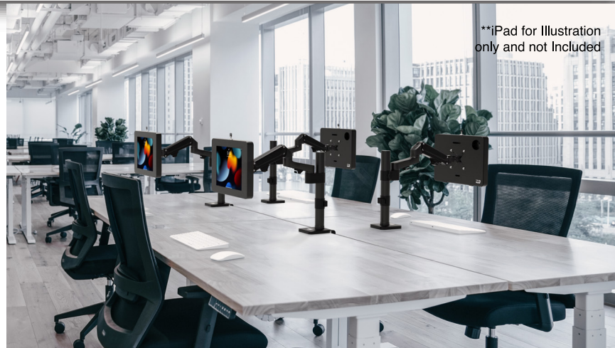
**iPad for Illustration only and not Included