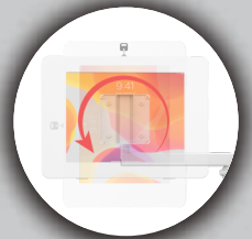
Portrait & Landscape Flexibility