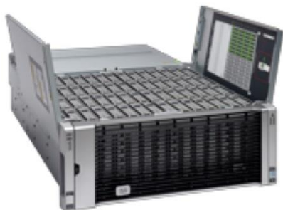
Figure 1. Cisco UCS S3260 Storage Server

The Cisco UCS® S3260 Storage Server (Figure 1) is a modular, high-density, high-availability, dual-node storage-optimized server well suited for service providers, enterprises, and industry-specific environments. It provides dense, cost-effective storage to address your ever-growing data needs. Designed for a new class of data-intensive workloads, it is simple to deploy and excellent for applications for big data, data protection, software-defined storage environments, scale-out unstructured data repositories, media streaming, and content distribution.