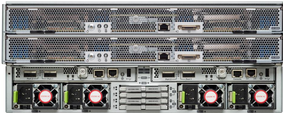
Figure 3. Cisco UCS S3260 Chassis with 2 M5 Server Nodes