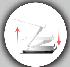
Portable and Compact Collapsible Design